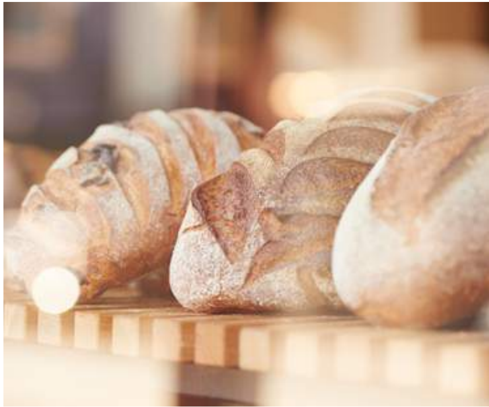
Laurent, Toorak Village