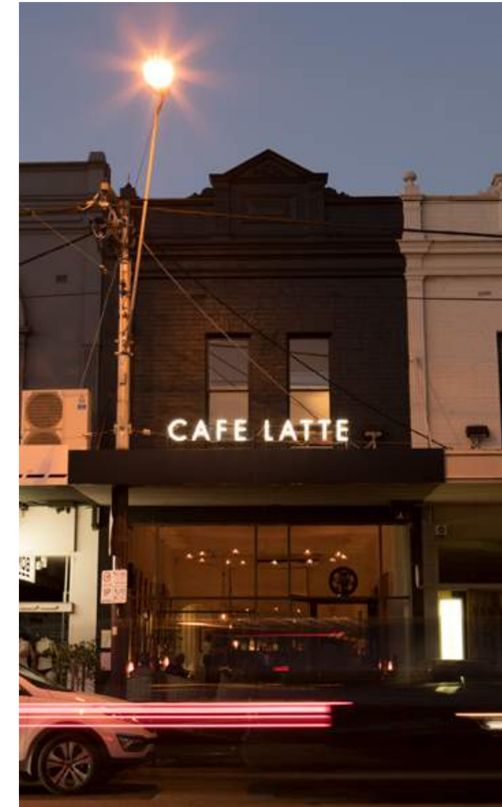
Cafe Latte, Hawksburn Village