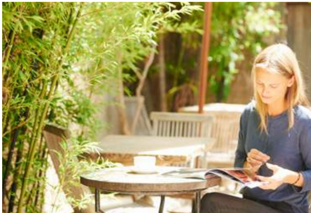
Husk, Hawksburn Village