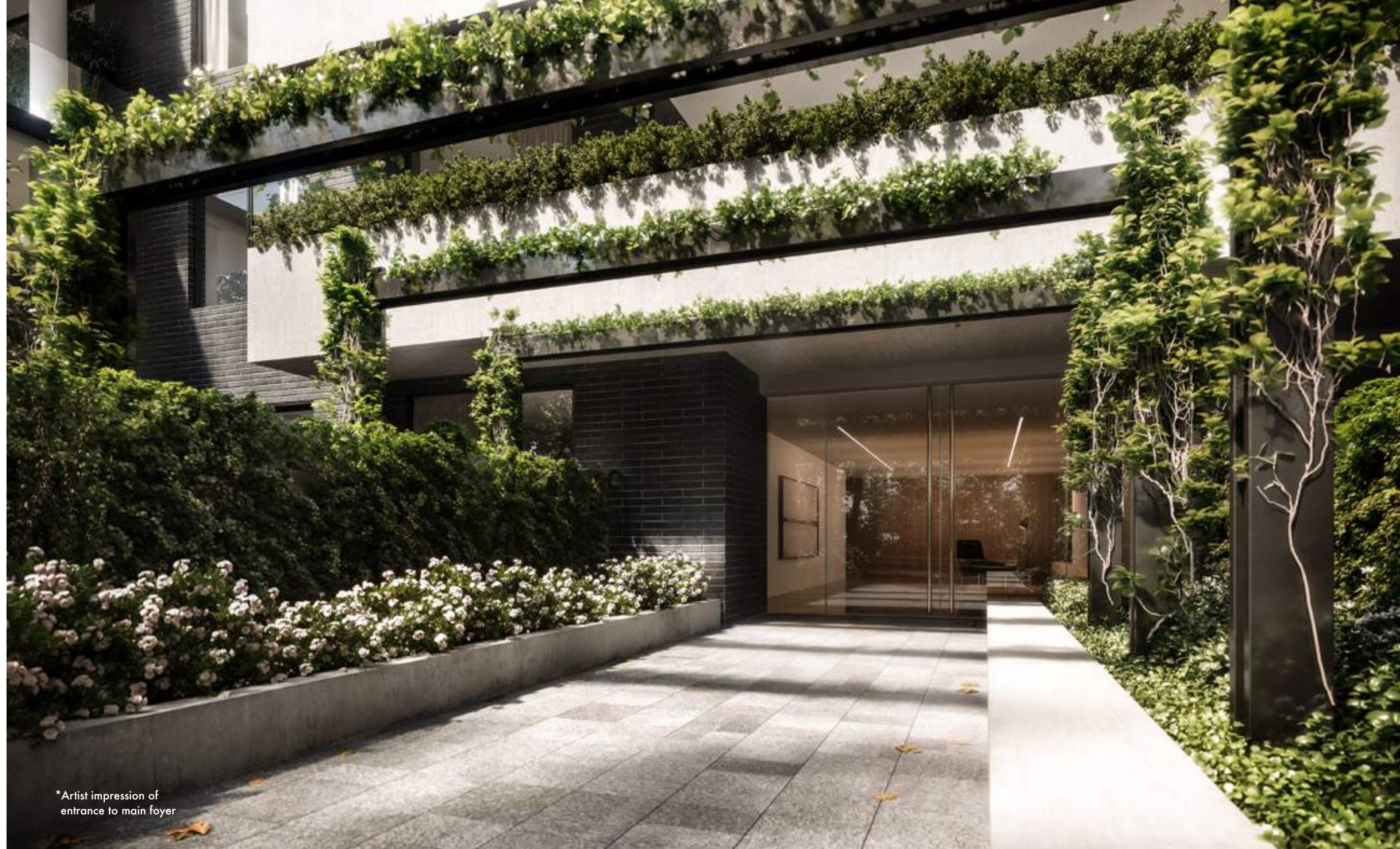
*Artist impression of entrance to main foyer

Never compromise on size and lifestyle - The Springfield, Toorak, a natural choice.