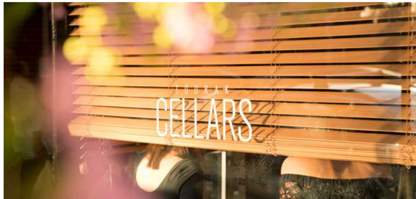
Toorak Cellars, Beatty Avenue