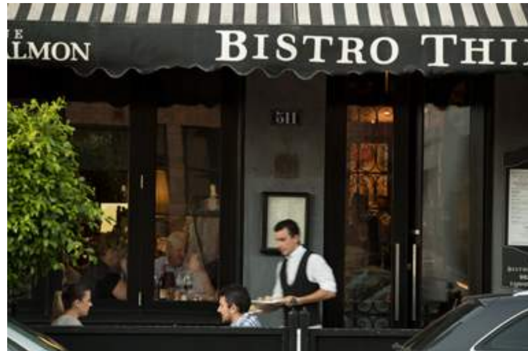
Bistro Thierry, Hawksburn Village